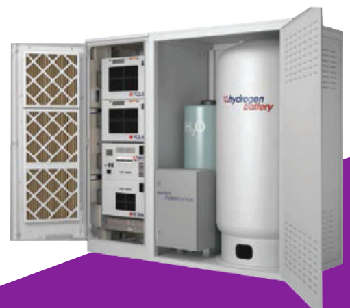
5kW Fuel Cell system with Electrolyzer, Water Collection Tank and Hydrogen Tank